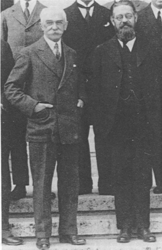
Pierre de Coubertin et Albert Thomas, lors de la réunion d'experts en matière d'éducation physique et de sports, en 1929 au B.I.T à Genève

Les progrès des sports irritent les partisans de la guerre des classes et intéressent sympathiquement ceux qui espèrent en des moyens plus doux pour amener les changements désirés par eux dans l'organisation de la société. La pratique des exercices physiques n'égalisent pas les conditions, mais elle égalise les relations et il est probable qu'ici la forme soit plus importante que le fond